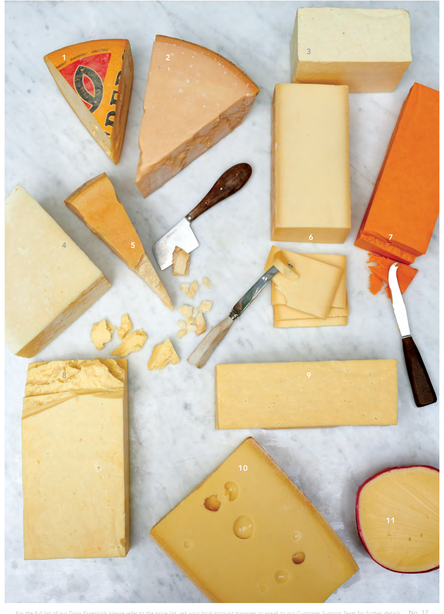
For the full list of our Dairy Essentials please refer to the price list, ask your local account manager or speak to our Customer Support Team for further details No. 12