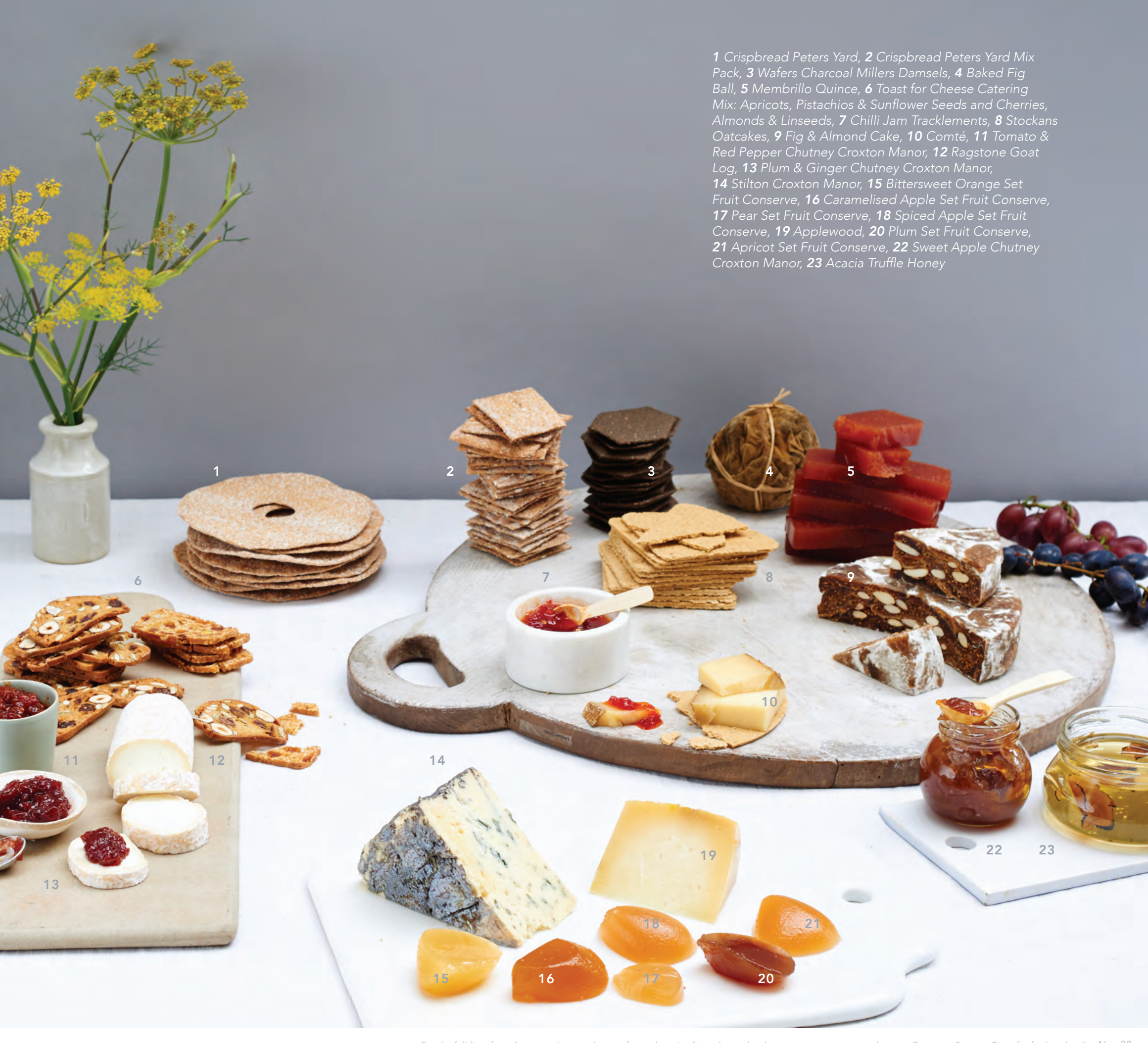
For the full list of our Accompaniments please refer to the price list, ask your local account manager or speak to our Customer Support Team for further details No. 22