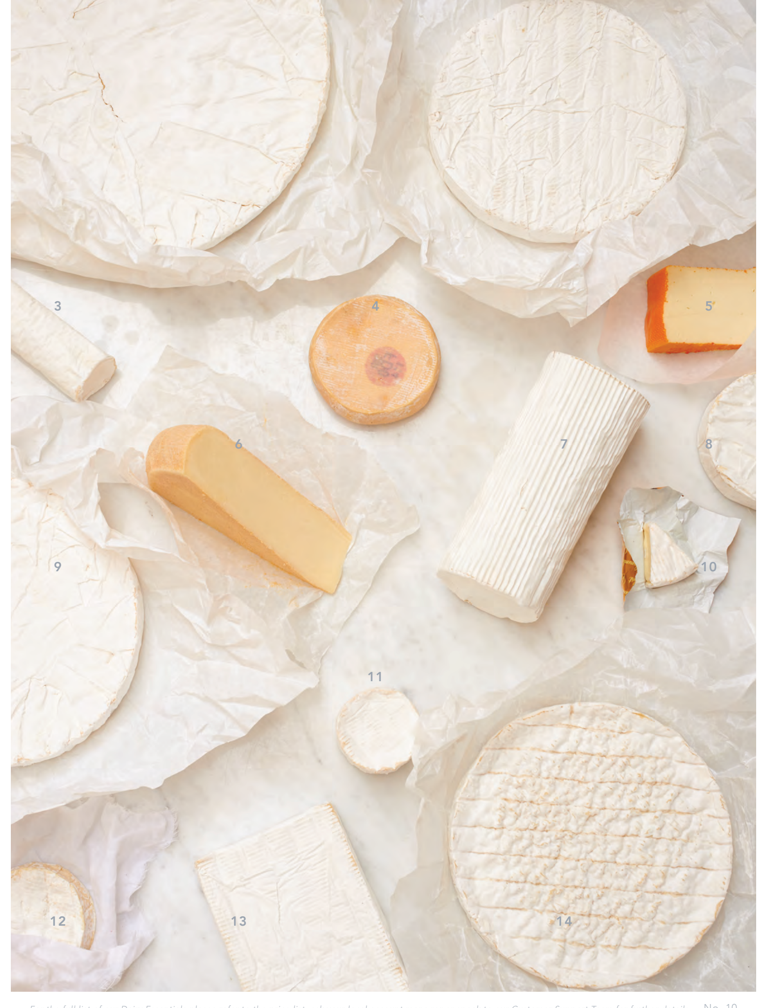
1 Brie West Country Croxton Manor 2.3kg, 2 Brie West Country Croxton Manor 1.1kg, 3 Melusine Goat Log 180g, 4 Reblochon AOC Savoie Lait Cru 240g, 5 Port Salut 2kg, 6 Raclette French Livraidois 1/4 1.75kg, 7 Chevra Log 1kg, 8 Camembert Le Fin Normand 250g, 9 Brie French 60% 1kg, 10 Camembert President Portion 8 x 30g, 11 Capricorn Goat 100g, 12 Camembert President 145g, 13 Brick Brie 900g, 14 Camembert Rustique Artisan 1kg

Please note, weights given are approximate