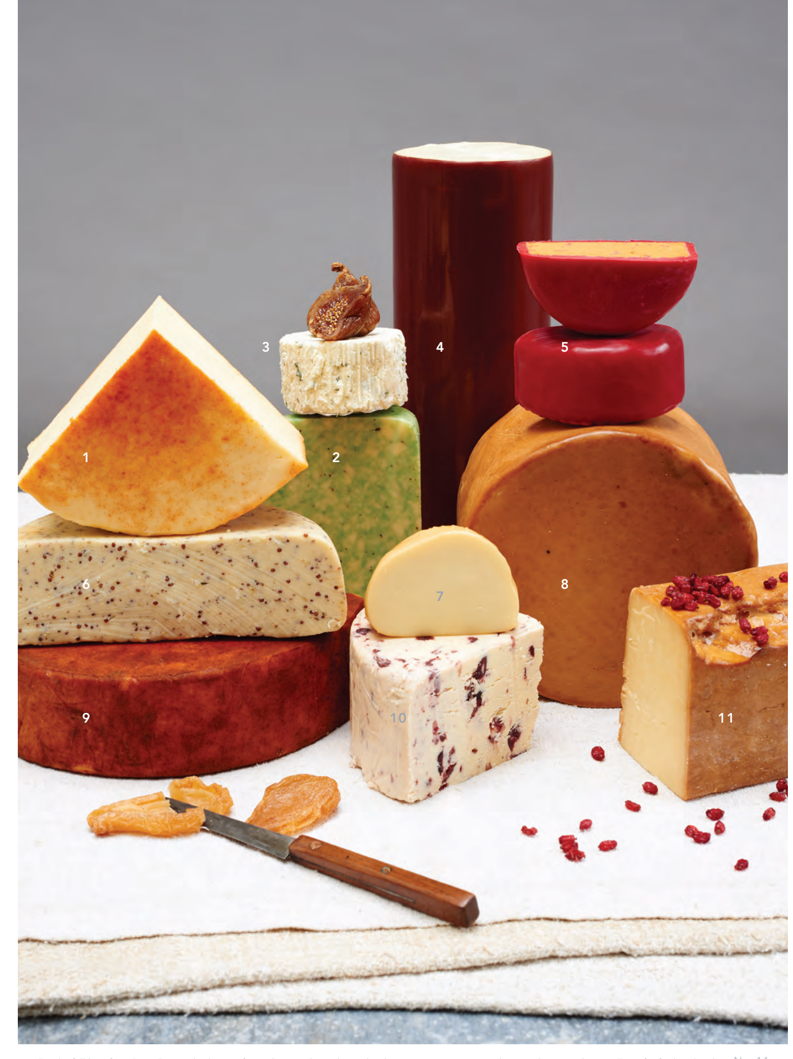
1 Applewood Half 1.5kg, 2 Sage Derby Block Croxton Manor 2.5kg, 3 Boursin Garlic 150g, 4 Smoked Log 2kg, 5 Red Devil Snowdonia 200g, 6 Y Fenni 1.5kg, 7 Mozzarella Smoked (Scamorza) 250g, 8 Oakwood Smoked 2kg, 9 Charnwood 1.2kg, 10 Wensleydale & Cranberries Hawes 1.25kg, 11 Cheddar Smoked Block 2.5kg